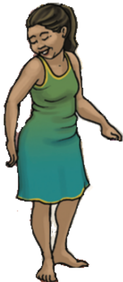
ka makuahine / ka māmā